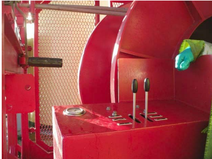
Figure showing spooler arm and hydraulic spooler controls where injured person was standing

A member has reported an incident in which a spinning handle on a spooler arm hit someone on the upper arm, wrist and knuckles, causing light bruising. The incident occurred when a hydraulic grapple (complete with 12m section of 20" pipe) was being recovered to deck using the vessel's crane whip line. A third party technician, who was operating the hydraulics at the powered reeler, was paying in on the hydraulic hoses, and using the manual handle on the spooler arm to evenly wrap the hoses on the drum. As the grapple was being lifted inboard the vessel took a heave, which pulled the hoses tight causing the handle on the spooler arm to spin round. As the handle spun it caught the third party technician on the upper arm, wrist and knuckles. The technician was wearing full personal protective equipment (PPE) at the time but was taken to the medic, where he was checked over and found to have light bruising.