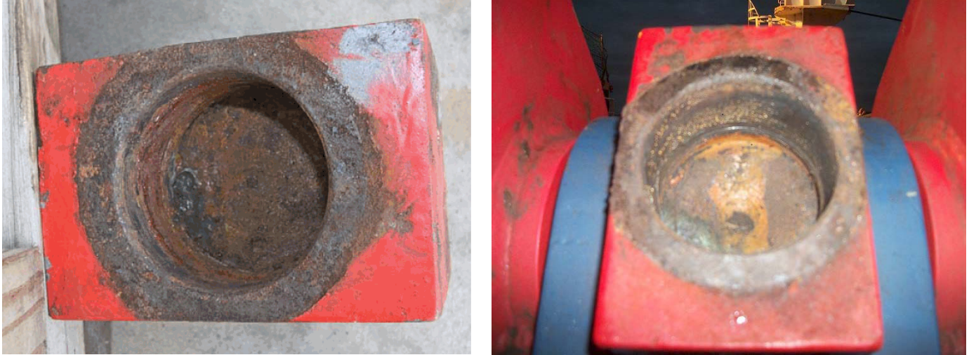
Clevis pictured after failures

A member has reported a number of incidents in which a luff ram has parted at the clevis. The first incident occurred during a load test of a remotely operated vehicle (ROV) system. During recovery of the ROV whilst latched into the snubber, another luffing ram on the same launch and recovery system (LARS) parted in the same manner. Subsequently, during an ROV launch of the same system, the replacement starboard luffing ram parted at the clevis. There were no injuries or damage to equipment.