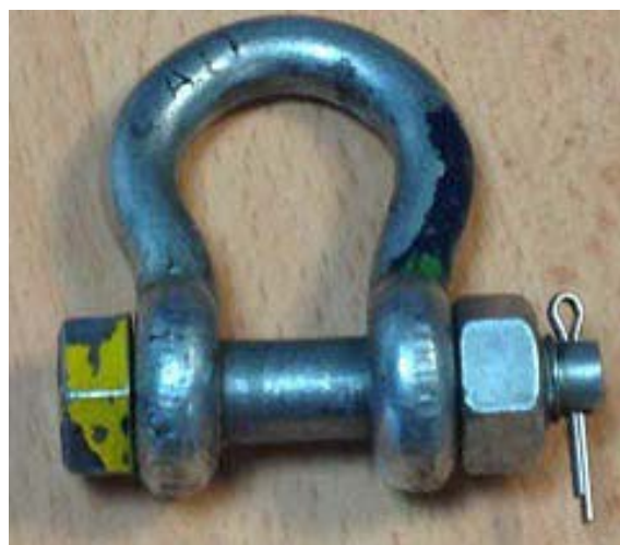
Shackle with correct configuration and split pin (but colour code unclear)